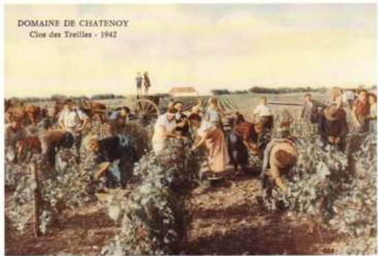
DOMAINE DE CHATENAY - CLOS DES TREILLES 1942

A detail from an etching of the family estate, with the comment: "...father and son, since 1560."