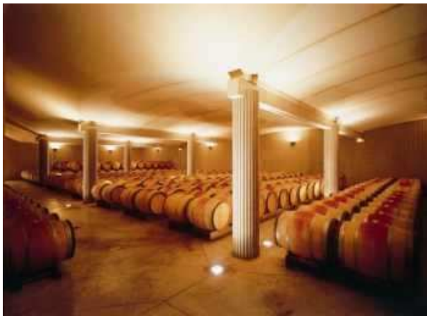
The underground barrel cellar for the Pinot Noir and Cuvée Pierre Alexandre. The cellar houses 500 barrels.

Above left and right: a new building, begun in October 2004, for the reception of grapes during the harvest. This state of the art facility, equipped with multiple sorting tables, began operation in September 2005. The goal is to receive the fruit, sort it, and move it to the presses as rapidly as possible, so as to entirely preserve the flavors and aromas of the grapes.