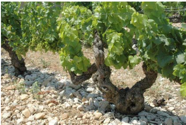
A Grenache vine, planted in 1928 on limestone clay soil. This soil drains well, warms quickly, and retains heat, making it ideal for ripening Grenache.