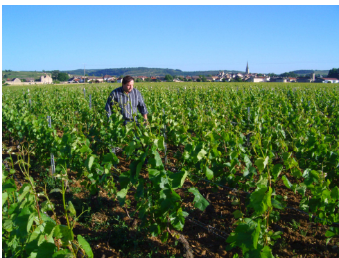
The Bourgogne Chardonnay vineyard on June 4, 2010. The domaine's building is visible at top left and the village of Meursault is on the right.