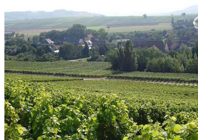
The Verdigny vineyard. The sloping terrain and southern exposure is ideal for ripening Sauvignon Blanc grapes.

Didier and Luc Prieur describe the 2010 vintage as a vintage of great Sancerrois typicity, despite a less than ideal growing season. It began late, with budding about April 20th, but the fruit set was normal due to the warm Spring. Flowering was difficult due to rain in late May and early June, thus reducing crop size. The summer was hot and mostly dry, especially in August through mid-September. The grapes ripened gradually and developed flavor and concentration without the loss of acidity. The Prieurs harvested with fine weather in late September, and did a thorough selection of grapes at the winery. They fermented slowly at low tempera-